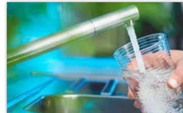
Drinking Water Analysis Webinar Series