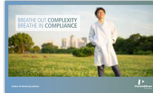
Outdoor Air Monitoring Solutions Brochure