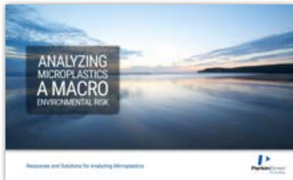
Microplastics Analysis Brochure