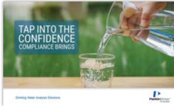
Drinking Water Analysis Brochure

Explore our brochures to learn more about our environmental testing capabilities and offerings – from soil to water to air.