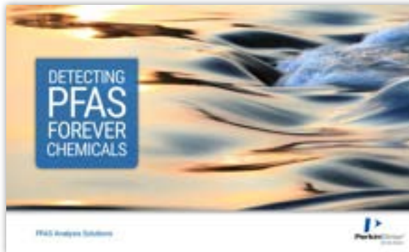
PFAS Analysis Brochure