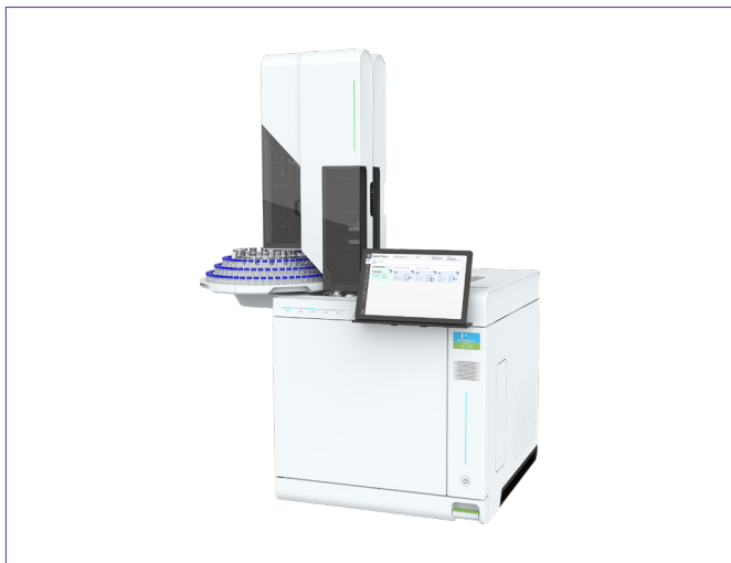
PerkinElmer GC 2400 System

The GC 2400 System was configured with an FID and with PerkinElmer Elite 225 analytical column for the analysis of cetyl alcohol content, and identification of impurities. PerkinElmer SimplicityChrom™ Chromatography Data System (CDS) Software offers the user the convenience of automatically-generated suitability data.