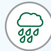
Air Pollution Fallout