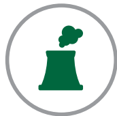
Combustion of Fossil Fuel